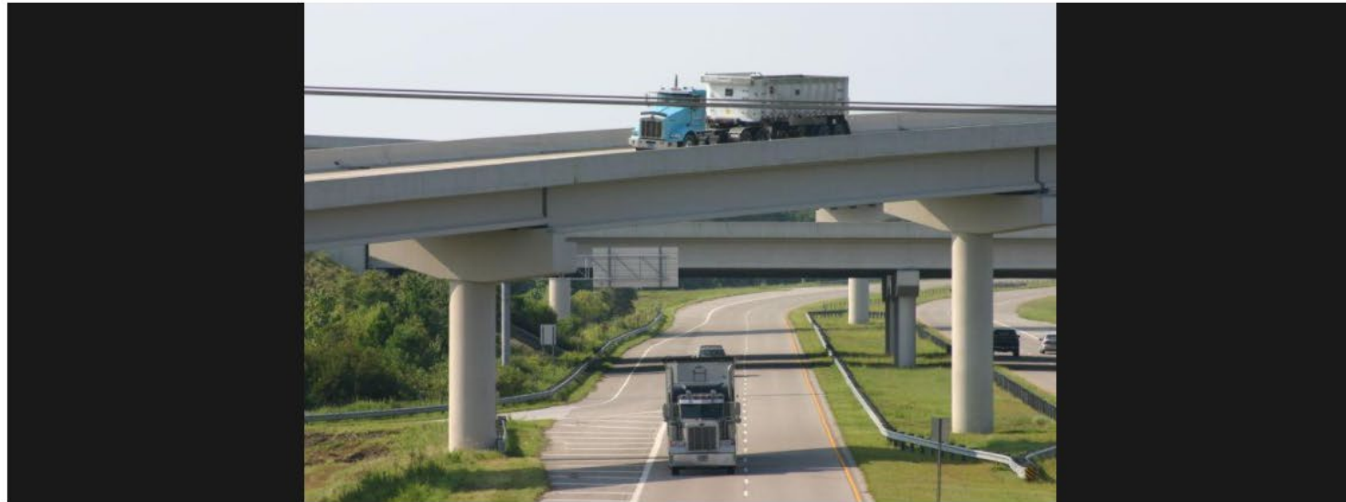
Trucks travel through the interchange of S.C. 31 and S.C. 22. The proposed I-73 will one day feed into S.C. 22 (below).

FROM STAFF REPORTS INFO@MYHORRYNEWS.COM Dec 21, 2017 Updated Dec 22, 2017 0