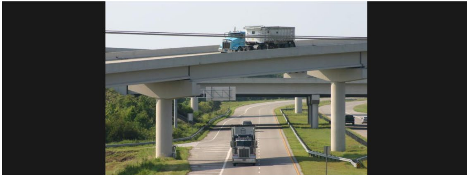
Trucks travel through the interchange of S.C. 31 and S.C. 22. The proposed I-73 will one day feed into S.C. 22 (below).